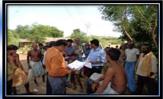
Baseline Survey and Project Development Workshop